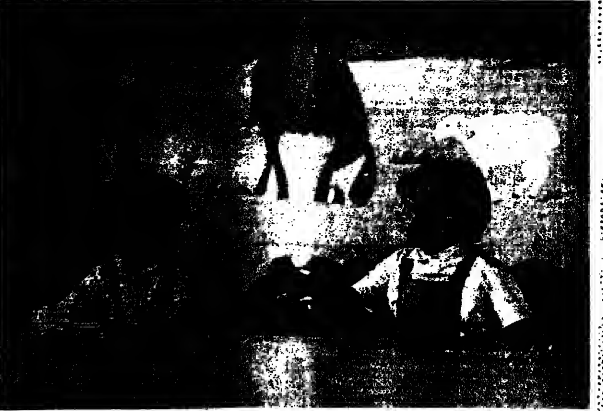
Children playing at the Kinderhouse